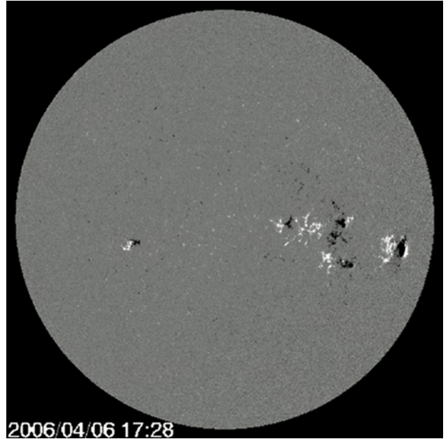
Figure 8.12 A magnetogram of the Sun. The bright and dark spots show significant magnetic activity at the surface of the Sun.

lines is proportional to the strength of the external magnetic field.